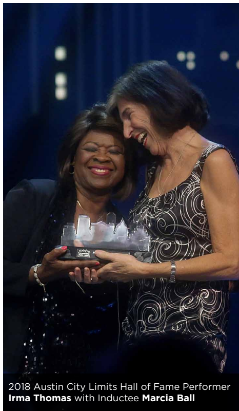
2018 Austin City Limits Hall of Fame Performer Irma Thomas with Inductee Marcia Ball